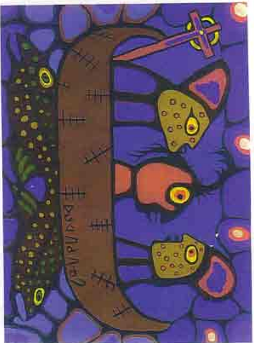
The Indian Who Could Not Fight the Flood of White Sows and the Sickness brought by the White Shaman -

I'm very fortunate to be a Native person who knows a little bit of the history of these images.