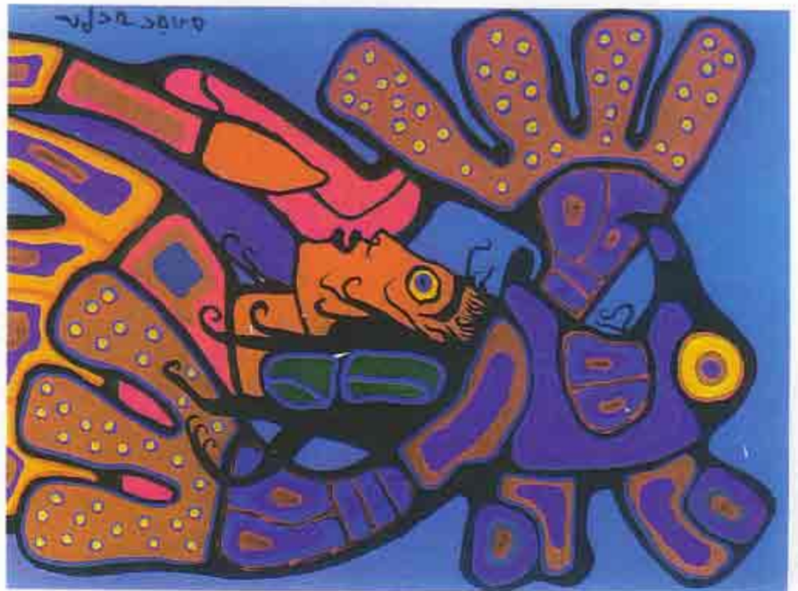
Member of Ida Ojibwa Thunderbird Lodge, Medicine Society, Medicine Woman, Central to the Loon Clan 1998 Acrylic on canvas 48 x 36 inches 121.9 x 91.4 cm

The Ojibwa believed the thunder to be a great massive bird, a thunderbird, whose eyes shoot out lightning and thunder. The first thunder in early spring was something good to hear, for the Ojibwa welcomed their protector again from its home in the south where it had been all winter. Offerings of tobacco were placed on the ground. Sacred pipes were smoked by the elders to the thunderbird.